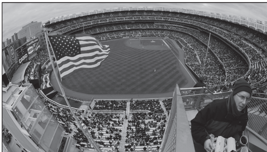
New Yankee Stadium on Opening Day, April 16, 2009